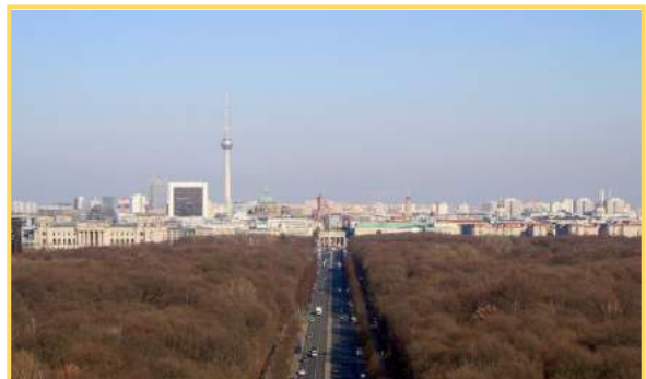
Tiergarten (Park) from the Berlin Victory Column