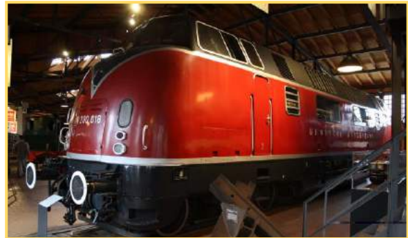
V200 Diesel at the Deutsches Technikmuseum