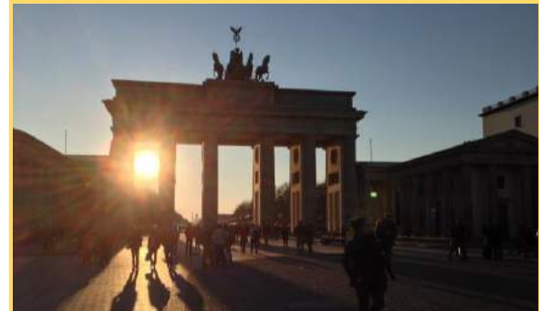
Brandenburger Tor (Brandenburg Gate) at sunset